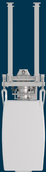
Suspended with aspiration hood