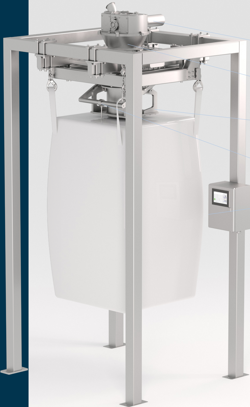
Dust-tight motor cover