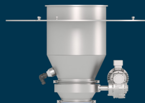
Discharge hopper with rotary feeder