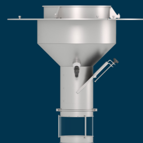
Discharge hopper with slide gate